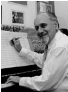
composer and arranger

There are many different jobs in the music business: